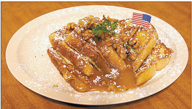
Krazy Krunchy Freedom toast from Pappy's Coffee Shop.

Pappy's is the only Bakersfield restaurant I know that offers fried bologna and eggs ($8.99) on its breakfast menu. So go nuts. For our lunch visit, the soon-to-leave-for-college students went for the Philly steak sandwich ($9.29), the chipotle bacon cheeseburger ($8.99) and the Pappy's Western burger ($8.99), while I selected the open-faced chili size burger ($8.89). One wanted to order the Driller burger, but after four years as a Patriot football player, he just couldn't. The best of the group had to be the chipotle burger, with a dark red salsa on it that the waitress told us was made fresh on the premises. Figures that a Pappy's regular would know to order that. The guy who ordered the Western burger gets it regularly and proclaimed, "If this burger was a girl, I'd ask her out on a date." (He's been