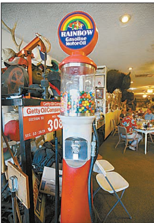
A gas pump gumball machine sits near the entrance of Pappy's Coffee Shop.

CONTINUED FROM D1 They then transitioned into a story from junior high with all the details of the most hated boy in their class and his misadventures. Eventually the conversation came back to politics and personal strengths and weaknesses of each of the Republican presidential candidates. Mark them undecided at this stage of the race. The longtime Pappy's fan said he remembered when the coffee shop boycotted Heinz ketchup because 2004 Democratic candidate John Kerry was married to Teresa Heinz. He didn't know when they switched back. Despite all that, Pappy's was not exactly politics central when I've visited. I've not once eavesdropped on any heated political debates. But you really don't need a political sideshow to keep you entertained with so many foods worth ordering. My personal favorite is the crunchy "Freedom" toast with walnuts and caramel sauce ($8.29). It's incredible. You get six thick slices of the egg-cinnamon griddle-fried toast covered with what looks like a small fortune of walnuts and caramel sauce. I rationalize eating this by pointing to all the studies saying that walnuts are a nearly perfect food, and skip dessert to make the caramel sauce acceptable. I also add no maple syrup. This is practically health food. If you're averse to anything healthy anyway,